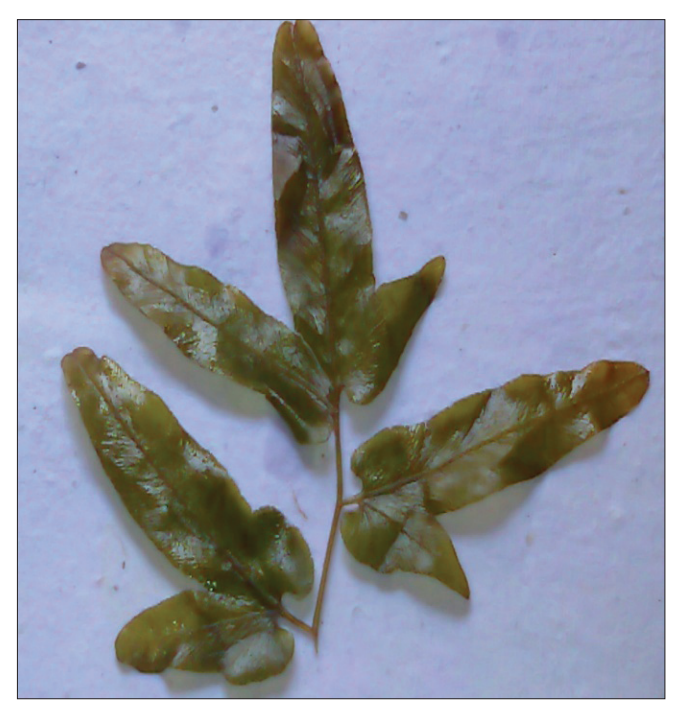
Figure 1: Leaf of Lygodium flexuosum

It was fixed in formalin-acetic-alcohol and acetic-alcohol washed with water and preserved in 70% alcohol for study. Customary method of dehydration and embedding were followed. The initiation and further development of the root primordium has been studied in L. flexuosum . A cell in the growing region of the rhizome apex enlarges showing pyramidal appearance and produces cells laterally on all its faces. It appears that the surrounding cells in the expanding regions of the rhizome apex arrange themselves around the pyramidal cell and its derivatives and divide to form the developing root, primordium is almost next to the rhizome apex. A central pyramidal cell with four