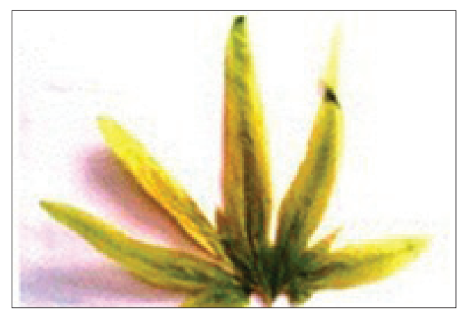
Figure 2: Single leaf of Lygodium flexuosum

well-defined faces and number of surrounding cells usually in two tiers are seen. The procambial tissue differentiates between this group and the differentiating vascular tissue of the rhizome. A mature root apex is some what obtuse and is protected by a conical cap. Endodermis is double layered. A conspicuous tetrahedral cell is observed at the central region of the apex. In lygodium, the apical cells divide during early development of the root but no divisions were seen subsequently.<sup>[16]</sup> In Lygodium spores, a proximal cell formed by an initial division of the spore cut off a protonemal cell, a rhizoid and a wedge shaped cell by walls parallel to the polar axis.<sup>[17]</sup>