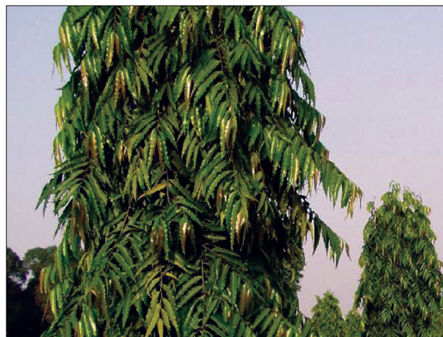
Figure 3: The whole tree of P. longifolia