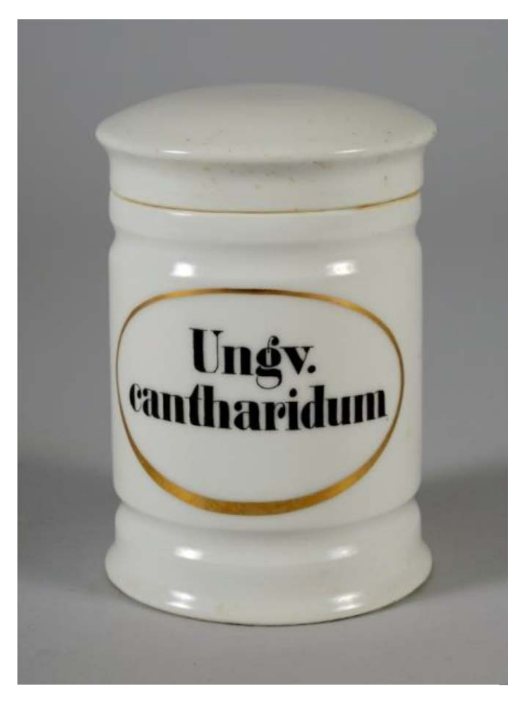
Figure 5: Apothecary ointment of cantharides jar. From collection of Sverresborg Trøndelag Folkemuseum (Norway). CC BY-NC-SA 4.0 license.

The New Belgian Pharmacopoeia ( Pharmacopoea Belgica nova ) contains the highest number of recipes among the analyzed pharmacopoeias (de Hemptinne 1854). The method of preparation of plasters is comparable to those mentioned earlier. Emplastrum Cantharidum (plaster of cantharides; page 161) was prepared by mixing 480 parts of beeswax, 420 parts of Venetian turpentine (obtained from Larix decidua Mill.), and olive oil with 280 parts of pulverized L. vesicatoria. Emplastrum Cantharidum Anglicum (English plaster of cantharides; page 161) was formulated by mixing 203 parts of beeswax and lanolin, 94 parts of rosin, 169 parts of pork lard with 332 parts of pulverized cantharides. Emplastrum Cantharidum Camphoratum (camphor plaster of cantharides; page 162) was compounded by mixing 96 parts of above plaster of cantharides with 4 parts camphor with small amount of olive oil. The last plaster— Emplastrum Cantharidum Perpetuum (constant plaster of cantharides; page 162) was prepared by mixing 387 parts of