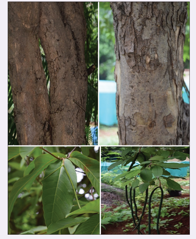
Figure 1: Photographs depicting the difference in stem, leaves, and pods of Holarrhena antidyscentrica (left) and Wrightia tinctoria (right)

In another study, the methanolic extract of HA seeds moderately protected against streptozotocin-induced diabetes at the dose of 300 mg/kg BW in rats. Its antidiabetic property was attributed to quercetin, which is used as a marker compound for HA.<sup>[12]</sup>