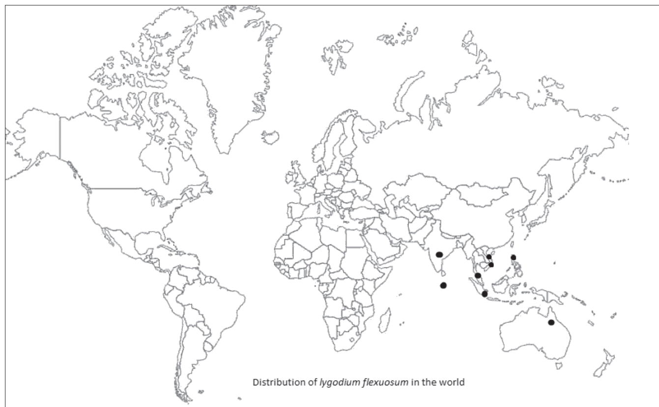
Figure 3: Distribution of lygodium flexuosum in the world