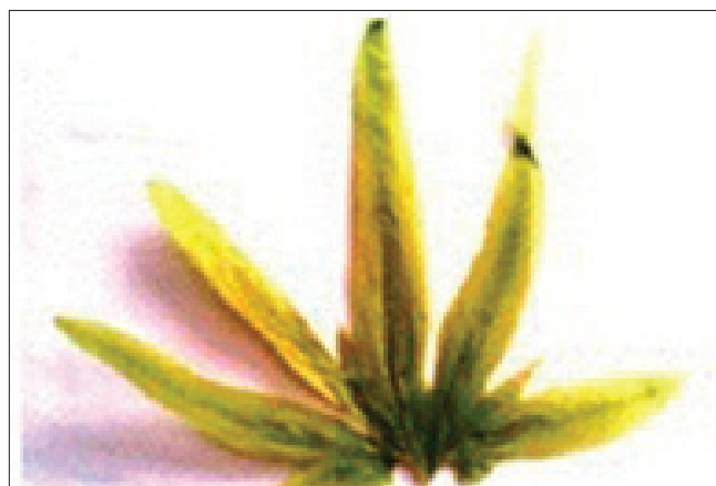
Figure 2: Single leaf of Lygodium flexuosum

well-defined faces and number of surrounding cells usually in two tiers are seen. The procambial tissue differentiates between this group and the differentiating vascular tissue of the rhizome. A mature root apex is somewhat obtuse and is protected by a conical cap. Endodermis is double layered. A conspicuous tetrahedral cell is observed at the central region of the apex. In Lygodium , the apical cells divide during early development of the root but no divisions were seen subsequently. [16] In Lygodium spores, a proximal cell formed by an initial division of the spore cut off a protonemal cell, a rhizoid and a wedge shaped cell by walls parallel to the polar axis. [17]