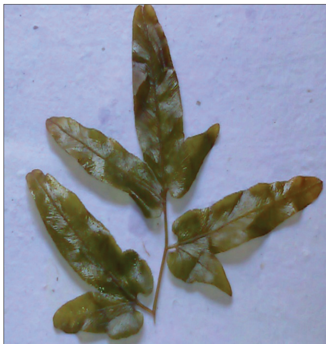
Figure 1: Leaf of Lygodium flexuosum

It was fixed in formalin-acetic-alcohol and acetic-alcohol washed with water and preserved in 70% alcohol for study. Customary method of dehydration and embedding were followed. The initiation and further development of the root primordium has been studied in L. flexuosum . A cell in the growing region of the rhizome apex enlarges showing pyramidal appearance and produces cells laterally on all its faces. It appears that the surrounding cells in the expanding regions of the rhizome apex arrange themselves around the pyramidal cell and its derivatives and divide to form the developing root, primordium is almost next to the rhizome apex. A central pyramidal cell with four