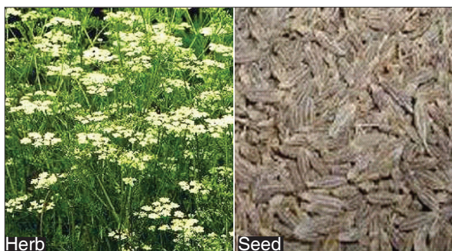
Figure 1b: Carum carvi

In aqueous and solvent derived seed extracts, diverse flavonoids, isoflavonoids, flavonoid glycosides, monoterpene glucosides, lignins and alkaloids and other phenolic compounds have been found. [24,47-52] Roots of caraway have also been found to contain