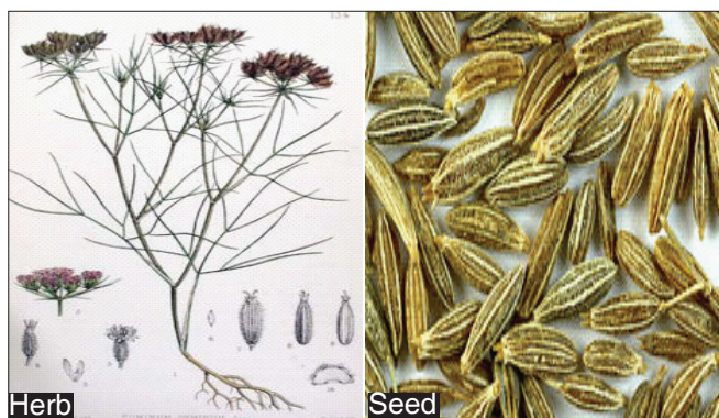
Figure 1a: Cuminum cyminum

In traditional medicine of Tunisia, cumin is considered abortive, galactagogue, antiseptic, antihypertensive herb, while in Italy, it is used as bitter tonic, carminative, and purgative. [8] In indigenous Arabic medicines, the seeds are documented as stimulant, carminative, and attributed with cooling affect and therefore form an ingredient of most prescriptions for gonorrhoea, chronic diarrhea and dyspepsia; externally, they are applied in the form of poultice to allay pain and irritation of worms in the abdomen. Seeds reduced to powder, mixed with honey, salt and butter are applied to scorpion bites. [9] In Poland, caraway is recommended as a remedy to cure indigestion, flatulence, lack of appetite, and as a galactagogue. In Russia, it is also used to treat pneumonia. In Great Britain and USA, it is regarded a stomachic and carminative. In Malay Peninsula, caraway is one important medicinal herb, and in Indonesia, it is used in the treatment of inflamed eczema. [10]