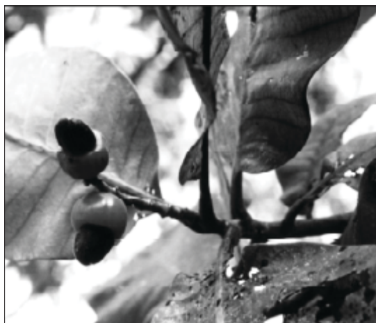
Figure 1: Plant of semecarpus anacardium showing the nuts

Ramprasath et al. investigated the antiinflammatory effects of SA nut extract on developing and developed adjuvant arthritis. Semecarpus anacardium significantly decreased the carrageenan-induced paw edema and cotton pellet granuloma. These results indicate the potent antiinflammatory effect and therapeutic efficacy of SA Linn. Nut extract against all phases of inflammation is comparable to that of indomethacin. [23]