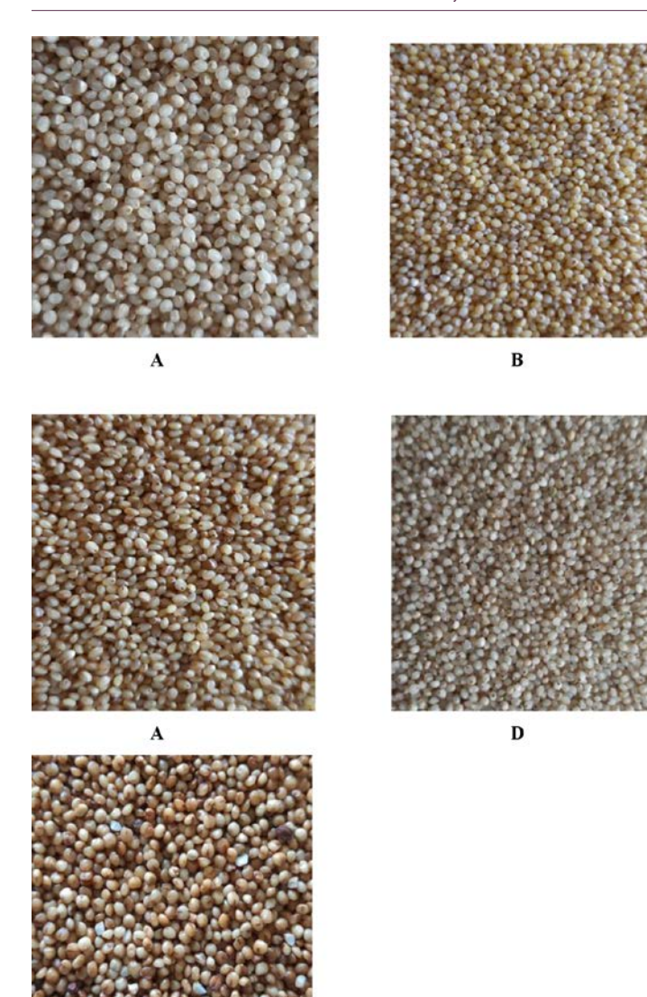
Figure 1: Driedgrains of A) Little millet, B) Porso Millet, C) Foxtail Millet, D) Barnyard Millet, E) Kodo Millet.